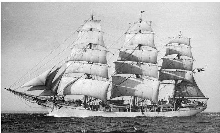
The actual Ship